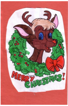
Christmas Cards Created by Grade 2A